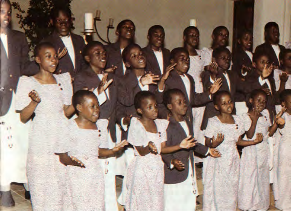
African Children's Choir in concert

eventually changed the course of my life. I went to work for a respected travel agency in Calgary, Alberta, coordinating tours for Christians. It was during that time that I became acquainted with Full Gospel Business Men's Fellowship.