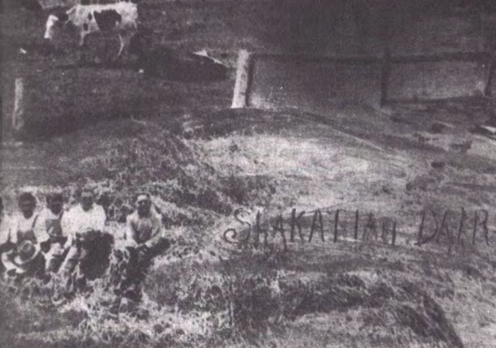
Below: Store in the front, cows in the back 1955. This shows only one of the four drive-in units which dispenses 6,750 gallons of milk daily, to their 20,000 customers, besides the cottage cheese and ice cream and other products. All four of the units are closed Sundays.