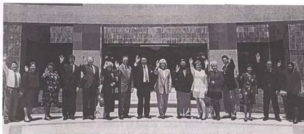
1998 International Headquarters staff in front of our new offices, serving the world with joy.

Because of obedience to God's Word and His prophecies, the Full Gospel Business Men's Fellowship International was born. Today it encompasses approximately 160 nations of the world. The Fellowship includes men of all races, cultures, languages and status of life. From presidents to paupers these men are causing the nations . . . to know The Glory.