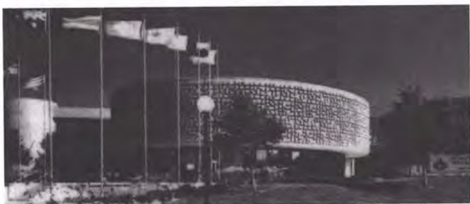
1978, newly dedicated International Headquarters Building. With a full time staff of 120 people reaching 75 nations of the world.