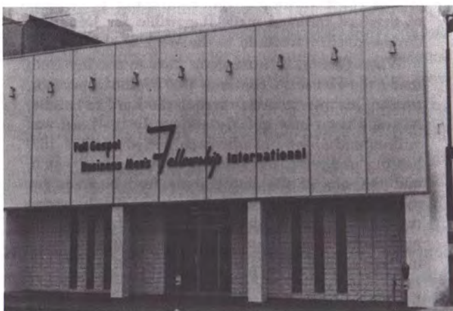
The lovely headquarters building of the Full Gospel Business Men's Fellowship International. This attractive building located strategically in downtown Los Angeles, is for Demos a "dream come true."