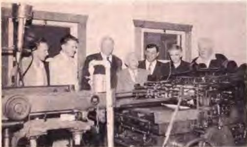
Early leaders rejoice to see first Voice come off the press.