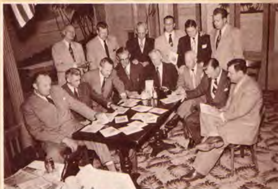
Official dedication of Full Gospel Business Men's VOICE.

In 1947 the full-gospel churches decided to put on a youth rally and I