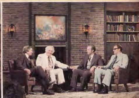
The weekly telecast "Good News!" brings testimonies of Christ-changed lives into millions of homes.

God had taught me that I could do nothing apart from Him. The next morning God began sending us money and manpower for the Fellowship. VOICE magazine was born. Today the Fellowship has more than 700,000 people meeting every month around the world.