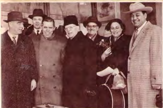
An early airlift—one of the many God has used to spread the Gospel to 77 countries.

Each pastor gave me 10 names, and when I invited these men not one declined. I decided to ask 12 businessmen each to give a three-minute testimony. I had never heard of this being done among Pentecostal groups, so we were blazing a new trail. It was going to be significant for the future Full Gospel Business Men's Fellowship. God was showing me the power of businessmen coming together to share their testimonies.