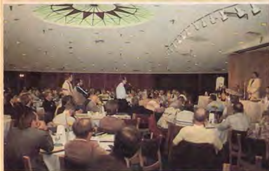
More than 1,500 chapter officers have benefited from Advance Leadership Training Seminars in 1981-82.

At one point—it was a Friday night—I knew that unless I heard from God, I was all through with the Fellowship. That was what He was waiting to hear! God wanted me to know that I could do nothing—it was He who would accomplish this work. At 3:00 A.M. He gave me a vision (described in greater detail in my book THE HAPPIEST PEOPLE ON EARTH ) giving me courage and conviction to carry me through any kind of setback. He showed me all of the continents of the earth, with millions of men of all races standing shoulder to shoulder. They were lifeless and miserable. Then the vision changed. . . . I saw the same men, but their faces were happy and their hands raised in praise. Once isolated from each other, they were now linked in love, spiritually alive, the glory of God upon them!