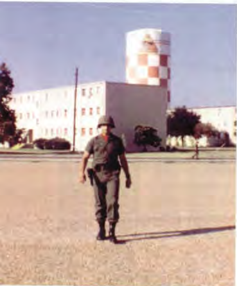
2LT Moe Rivera in Fort Hood, Texas, 1981.

to serve Him at a local church in southwest Houston.